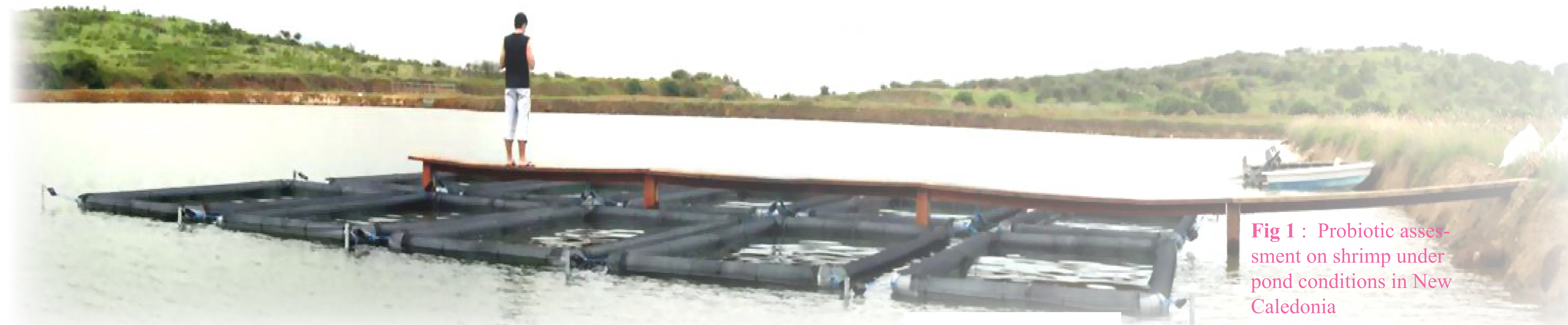
Fig 1 : Probiotic assessment on shrimp under pond conditions in New Caledonia

The probiotic Pediococcus acidilactici has been assessed on shrimps farmed under earthen pond conditions in a commercial farm currently affected by the «summer syndrome» (Fig 1) (Lemonnier et al, 2008; Castex et al., 2008). The probiotic improved the zootechnical results with increases in the survival rate (up to 15%) and final biomass (up to 12%) and lower feed conversion ratio (FCR). Beside, the shrimps fed probiotic exhibited in their digestive gland higher digestive enzymes activities (amylase and trypsin) and more nutrients in storage. Additionally, prevalence and load of pathogen Vibrio nigripulchritudo in hemolymph were reduced in animals fed with the probiotic.